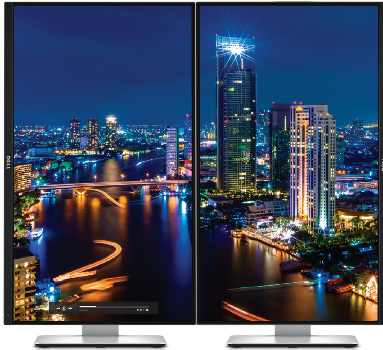
Dell UltraSharp 27 Monitor | U2715H 68.6 cm (27 inches)

Experience Dell UltraSharp performance and multi-monitor viewing at its best