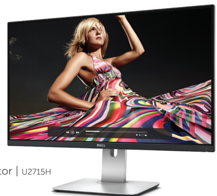
Dell UltraSharp 27 Monitor | U2715H 68.6 cm (27 inches)

For More Information visit www.dell.com/monitors