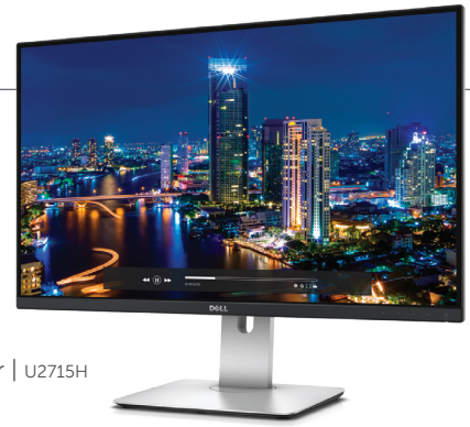
Dell UltraSharp 27 Monitor | U2715H 68.6 cm (27 inches)