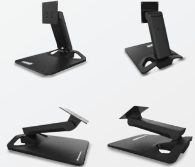
Universal AIO stand