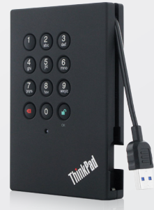
ThinkPad® USB 3.0 Ultraportable Secure HDD