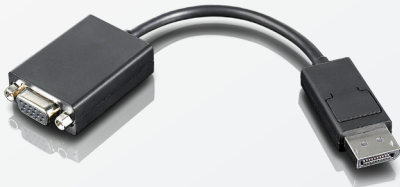
Display Port to VGA Monitor Cable (57Y4393)