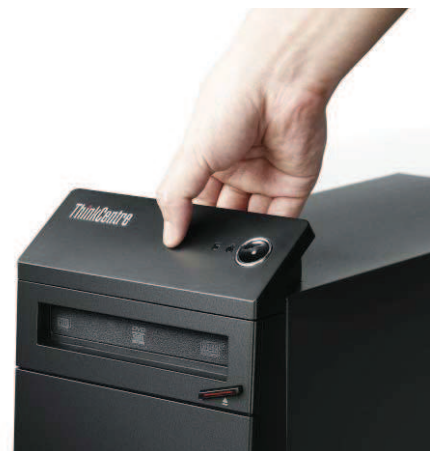
Lenovo ThinkCentre M91p Tower