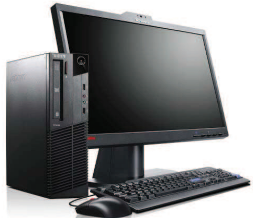
Lenovo ThinkCentre M91p Small with Lenovo ThinkVision monitor