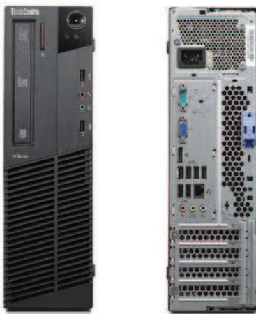
Lenovo ThinkCentre M91p Small