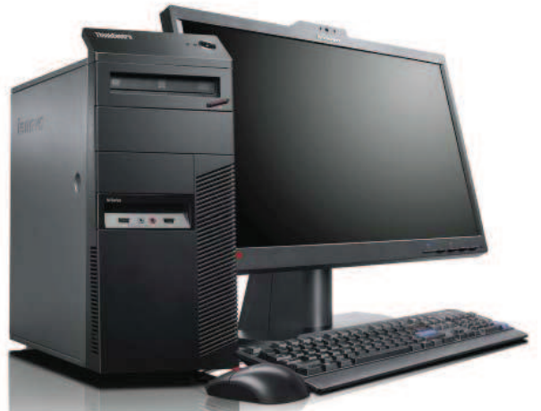
Lenovo ThinkCentre M91p Tower with Lenovo ThinkVision monitor