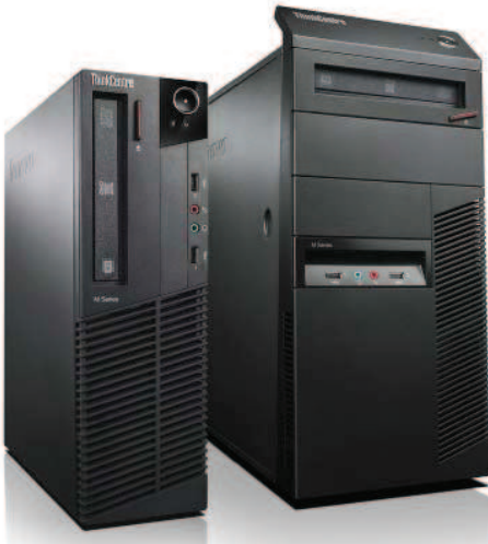
Lenovo ThinkCentre M91p Small and Tower