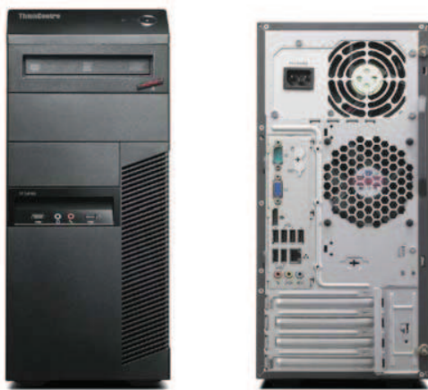
Lenovo ThinkCentre M91p Tower